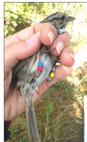
Song Sparrow with color leg bands.

The crew (and the birds) enjoyed a relatively cool and moist field season in the notoriously hot Trinity County summer—with only a few days over 100°F!