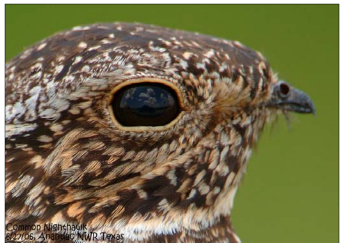
Common Nighthawk 8/27/06, Anahuac NWR Texas

And we have joined in the collaborative Common Nighthawk Migratory Connectivity Project led by University of Alberta, Smithsonian Migratory Bird Center, Environment & Climate Change Canada and with many non-profit, government, and academic partners across this bird's North America range. The Project's primary objective is to learn more about the distribution of this little-understood species. Initially, collaborators (including KBO) will be attaching satellite transmitting tags to Common Nighthawks during the nesting season in order to track their migrations and wintering habitat selection.