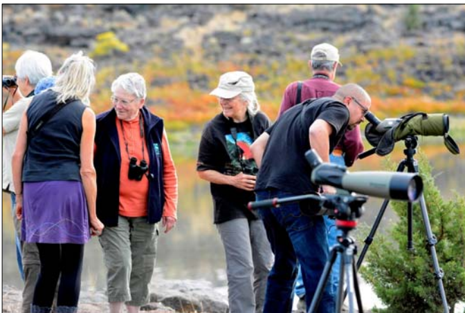
Birds and smiles on a Mountain Bird Festival field trip.