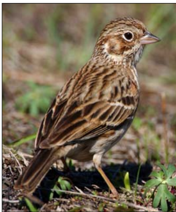
Oregon Vesper Sparrow.

With American Bird Conservancy and Center for Natural Lands Management, we will begin marking Oregon Vesper Sparrows with color leg bands in order to garner much-needed habitat use and nesting success information. The color bands allow habitat-use observational tracking without the need of recapture.