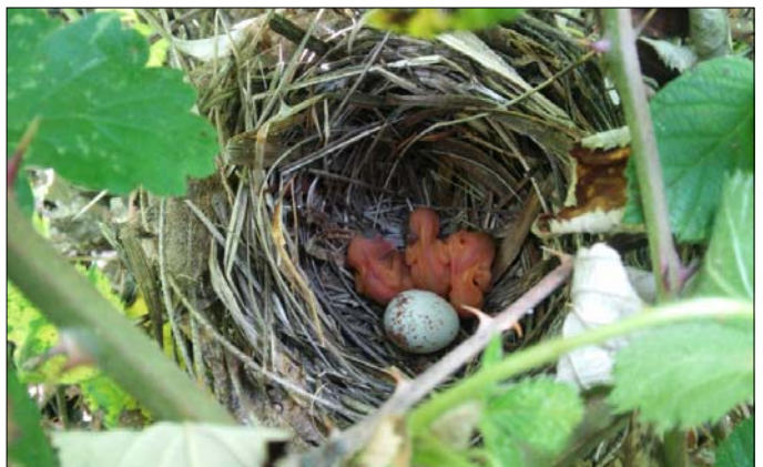
Yellow-breasted Chat nest on hatch day .