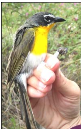
Yellow-breasted Chat with color leg bands and a geolocator.

The Trinity River crew had a fun and successful field season in 2016. We found 107 nests of our focal bird species this season! The first of our study focal species to begin building nests and laying eggs were the resident Song Sparrows, followed by the early-arriving migrant Tree Swallows, and shortly after by Yellow Warblers, Yellow-breasted Chats, and Black-headed Grosbeaks.