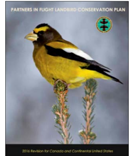
Partners in Flight Landbird Conservation Plan at www.PartnersInFlight.org

We also work with a number of similar networks that are not all necessarily focused on birds, but do provide substantial opportunities to integrate practices that benefit birds and other wildlife into large scale restoration programs. Through broad partnerships we ensure Klamath Bird Observatory's work is relevant for bird and habitat conservation in our backyards and across the broad geographies critical to migratory species.