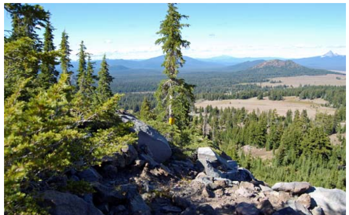
Crater Lake National Park vista.