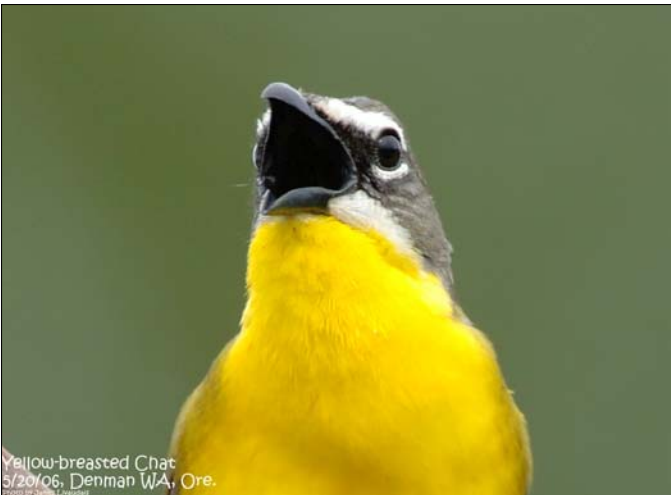
Yellow-breasted Chat singing his heart out.