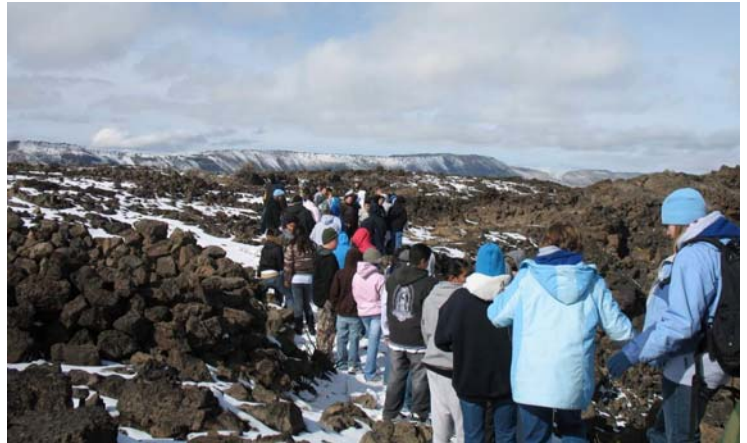
Seventh grade students from Tulelake High School investigated a burned area at Lava Beds National Monument as part of a habitat assessment lesson.

With KBO educators, seventh grade students from Tulelake High School investigated bird and habitat relationships in sagebrush steppe ecosystems along the Klamath Basin Birding Trail at Lava Beds National Monument. They compared habitat aspects of two sites—one recently burned in a wildfire and one without recent fire. Students assessed habitat quality by recording such data as the presence of sagebrush, herbaceous plants, and mature junipers. Based on their assessments, students discussed which focal bird species would most likely be living in the area and the overall health of the habitat for