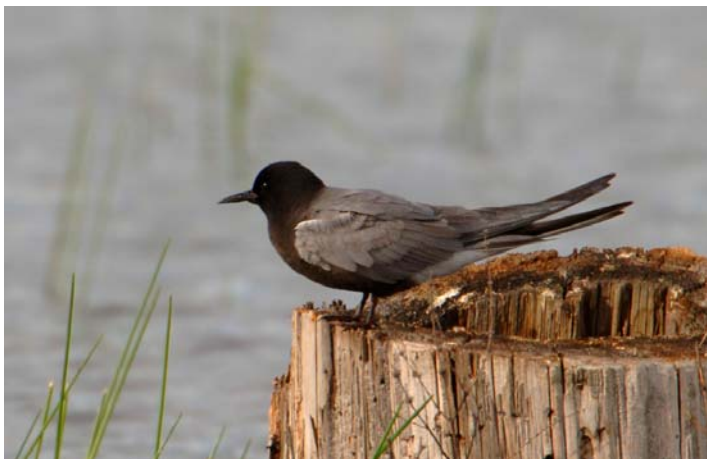
Black Tern populations have declined dramatically since the 1960s. KBO has monitored Black Terns in the Klamath Basin since 1996.

Just as different species of songbirds are found in habitats that offer the food sources, shelter, and water they require, aquatic bird species such as herons, rails, and pelicans also rely on specific habitats. As their group name suggests, aquatic birds depend on habitats associated with bodies of water such as lakes and wetlands. Because wetlands respond quickly to management, informed conservation can result in successful conservation. The U.S. State of the Birds, 2009 demonstrates how wetland bird conservation efforts have resulted in an increase of North American waterfowl populations, as well as wetland generalist species. However, some generalist wetland species, such as the Green Heron and Spotted Sandpiper, continue to decline. Likewise, specialist wetland species, such as the Black Tern, also show declines. For nesting, Black Terns depend on vegetation that emerges above still waters of biologically rich wetlands.