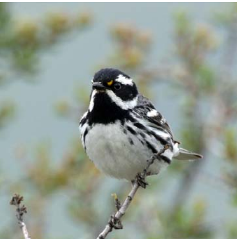
The Black-throated Gray Warbler relies on healthy breeding habitat in western United States and wintering habitat in Mexico.

Several birds which many of us would consider “common” in our bioregion are in trouble. Both year-round residents and Neotropical migrants indicate concern. Resident species include the Oak Titmouse, which is threatened by oak woodland habitat loss, and Lewis’s Woodpecker, which is dependent on oak woodlands and mature pine forest. Neotropical migrants including Western Wood-Pewee and Black-throated Gray Warbler have negative population trends. Their populations are dependent on