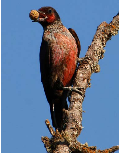
The Lewis’s Woodpecker depends on acorns as a food source. Their decline is associated with loss of oak woodlands and mature pine forest.

This national report serves to bring bird conservation issues to the forefront and highlight species and habitats of concern. However, there is reason for optimism. Through KBO’s research efforts we are identifying current forest practices that benefit birds. We are already undertaking positive actions within the Klamath-Siskiyou Bioregion to do