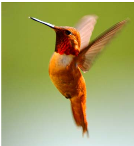
Rufous Hummingbird.

First you hear the high-pitched hum of his two inch wings, flapping 52 to 62 times per second. Then he zips past, a streak of bronze and green, tzzew tzupity tzupity tzuping at another bird in aggressive defense of his territory. During the breeding season, this male Rufous Hummingbird will perform elaborate J-shaped diving displays to attract females. Often times indistinguishable from Allen's Hummingbird, Rufous Hummingbirds tend to have more rufous-colored backs, though up to five percent of them are mostly green. Females have greener backs than males with rufous at the base of their tails.