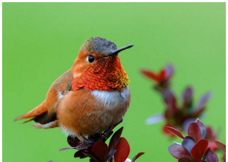
Rufous Hummingbird.

Along with Partners in Flight , the Western Hummingbird Project addresses hummingbird conservation issues in North America through habitat restoration and enhancement, monitoring, research, and education and outreach. KBO contributes to this project through collaboration with the US Forest Service Wings Across the Americas Program, the Hummingbird Monitoring Network, and many partners.